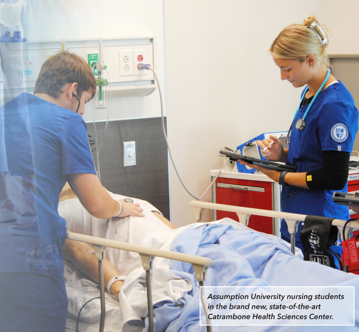
Assumption University nursing students in the brand new, state-of-the-art Catrambone Health Sciences Center.

on how to properly deliver intramuscular injections on mannequins before applying those skills to visitors of the clinic.